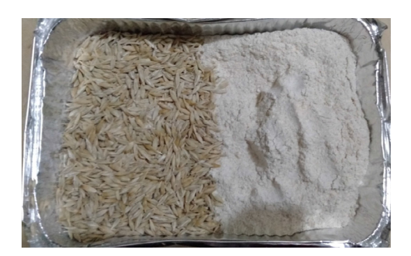
Fig. 1 Hull-less barley grains processing and grinding.

2.2.1.1. Milling process. Hull-less barley grains were moistened to 14% moisture for 24 h and then milled by hammer mill to whole meal barley flour (100% extraction) as shown in Fig. 1.